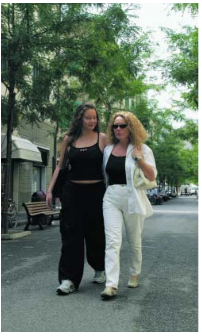
Older children with a parent with MS should be encouraged to express their concerns about changing family roles.

Changing roles within a partnership can create feelings of resentment and anger, especially if one or both members of the couple feel forced into making changes. Couples should be encouraged to discuss how certain changes would improve or disrupt their lifestyle and relationship. When communication problems exist within the partnership that hinder an open discussion of role changes, it is helpful to involve a professional counsellor or psychologist.