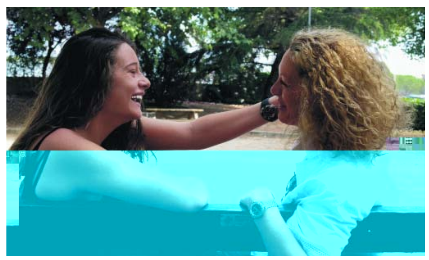
The original parent-child relationship may need renegotiating.

for certain tasks. Helping with some household jobs and with giving assistance to the parent with MS is acceptable. Children of a disabled parent often grow up to be particularly sensitive and caring adults.