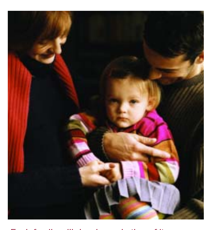
Each family will develop a rhythm of its own.

MS is expensive in different ways. In addition to the financial cost of MS, there is a costly drain on other family resources as well, including time, energy, and emotions. Families living with MS face the daily challenge of trying to distribute these valuable resources appropriately among all family members.