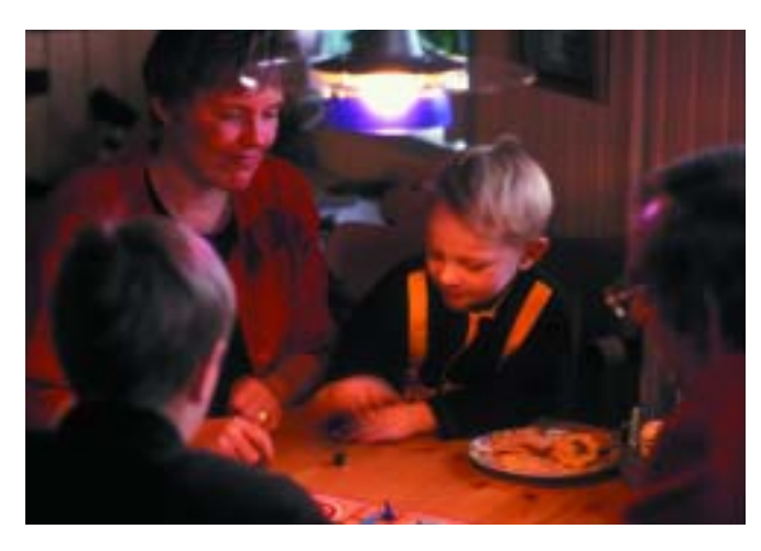
Focus on the things you can do together as a family – MS or not.

Children from the age of approximately six are able to understand, and perhaps notice more. They may become very insecure about their role in the family, and may have a tendency to take on too much responsibility within the home. They regularly need to be reminded that they are not to blame, and that they are not the adults in the family. Like younger children, children in this age