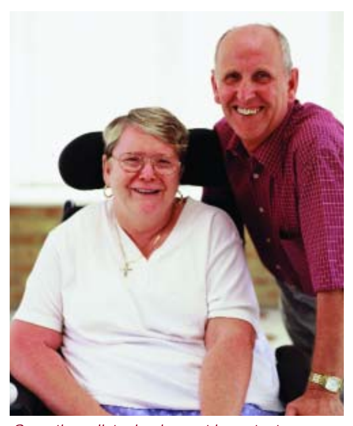
Sometimes listening is most important.

bathing, dressing or helping to use the bathroom. Some of these chores can be taken care of on a routine schedule. For instance, the house gets cleaned every Monday or the week's meals are prepared on Wednesdays and Saturdays. Other responsibilities, like helping to go to the bathroom, are completely unpredictable and must be addressed with alternative solutions, especially for those times when the carer must be out of the house.