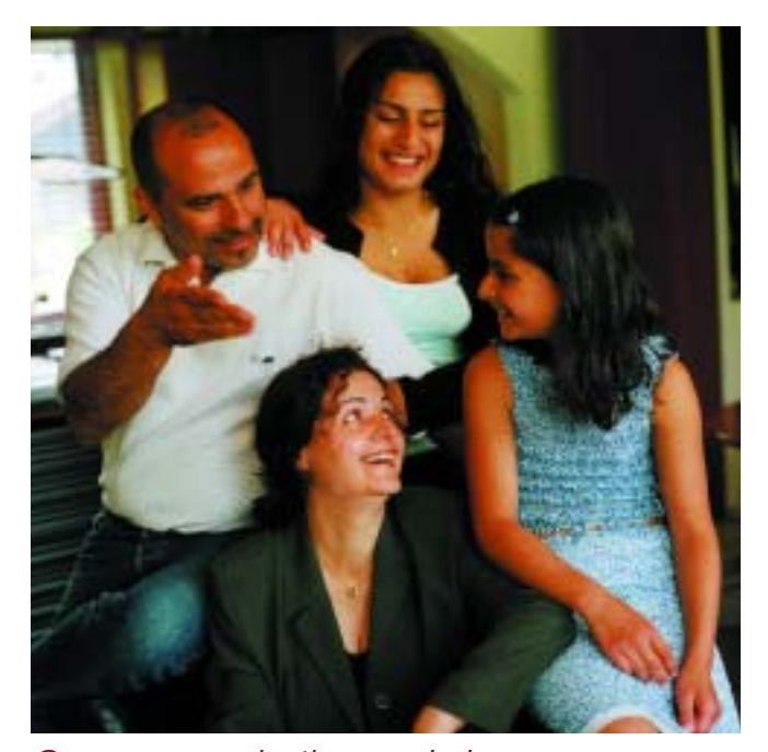
Open communication can help a family deal with MS.

receive appropriate information at the beginning. In order to confront these fears, it helps if the child feels that he or she can express them to the parent or to another person who is available to listen. MS society websites, support groups and informative literature may be helpful resources for older children with these types of concerns.